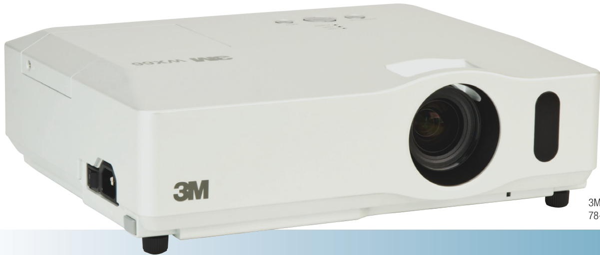
3M WX66 Projector 78-9236-7704-7

The WX66 projector offers a perfect balance of size, weight, brightness and compatibility. At only 7.9 lbs, 3000 lumens, and WXGA resolution, this projector is an excellent choice for a modern conference room or classroom and is compatible with wide aspect ratio PC's notebooks and video conferencing devices. It offers full connectivity including HDMI and is HDTV compatible. It is virtually a maintenance free multipurpose data projector offering great performance and low cost of ownership. The WX66 also features extended hybrid filter life with 4000 hour cleaning cycles.