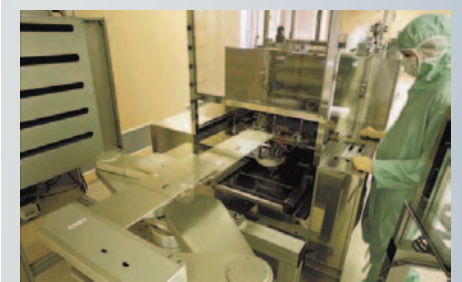
LC-TEC Manufacturing facility, Borlänge, Sweden

LC-TEC DISPLAYS AB , headquartered in Borlänge, SWEDEN, started operations in 1992 and has extensive experience in manufacturing and developing liquid crystal devices (optical-shutters & custom LCD's) on an R&D, prototyping and volume manufacturing level.