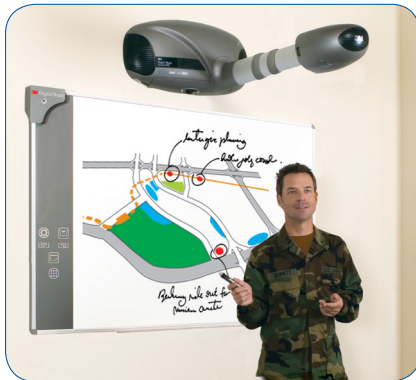
Shown with the 3M® Digital Media System 800