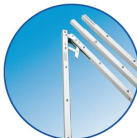
The frame consists of a square aluminium profile