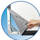
Screen surface with 5 cm wide black border reinforcement