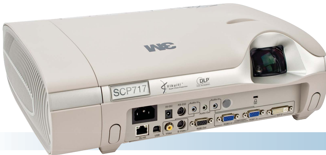
3M SCP717 Projector 78-9236-7701-3

If you have a mid-sized or space challenged classroom, conference room or boardroom that needs the latest innovations in projection technology, the 3M Super Close Projection System SCP717 delivers. One of the first high-brightness, DLP™, super close projectors to enter the market, the SCP717 features Brilliant Color™, DVI-D connectivity, an RJ-45 ethernet connection and an integrated wind tunnel design to minimize heat and fan noise. The extreme off-axis short throw makes the SCP717 a great choice to replace traditional ceiling mount projectors because it greatly reduces light in the presenter's eyes. The fully integrated connectivity makes it the perfect tabletop media hub too!