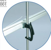
ergonomically designed handle – for height-adjustment and easy transportation